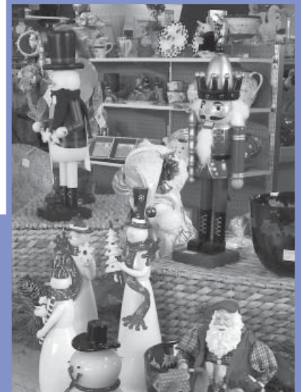
Holiday decorations are on display in the Thrift Shop.

Come see us anytime, but watch for us again next summer.